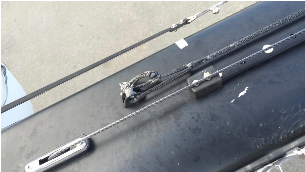
Photo system supplied with boats from build no 12 onwards

System supplied with boats up to build no 11